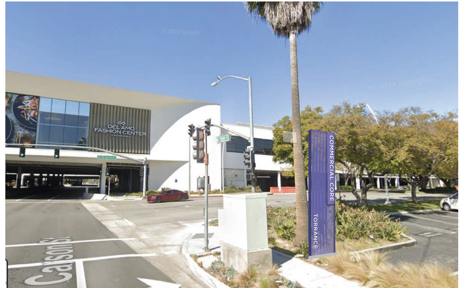
NOTE: NOT FINAL OR PROPOSED LOCATION- FOR DESIGN REFERENCE ONLY