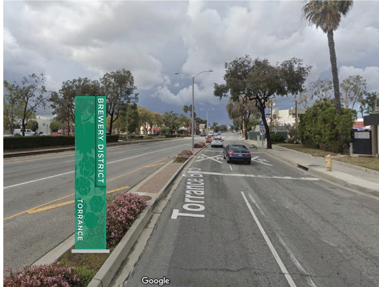
NOTE: NOT FINAL OR PROPOSED LOCATION- FOR DESIGN REFERENCE ONLY