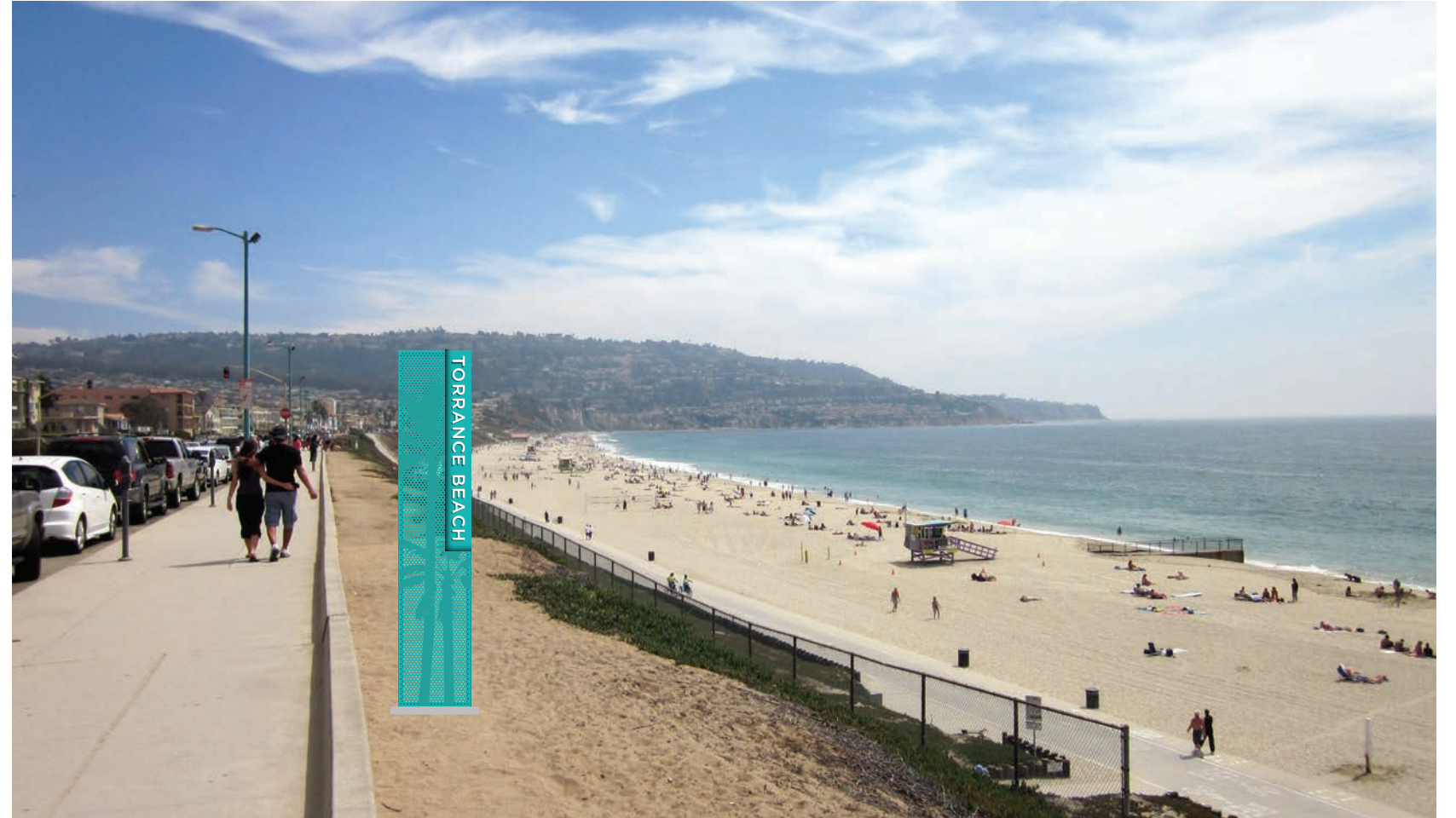
NOTE: NOT FINAL OR PROPOSED LOCATION- FOR DESIGN REFERENCE ONLY