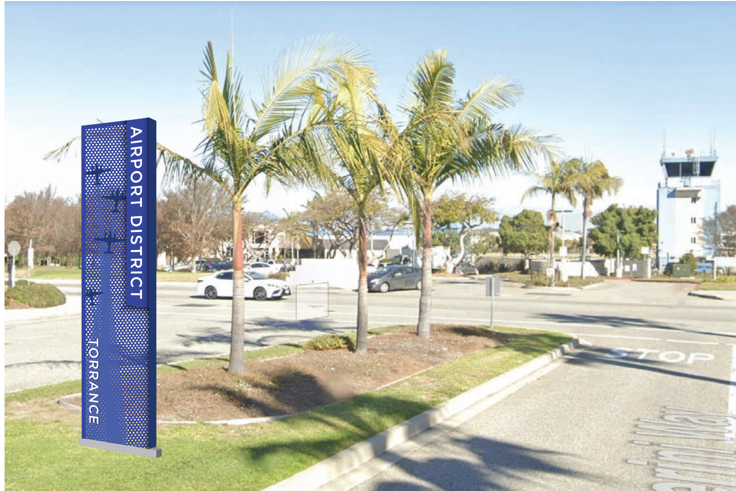
TE: NOT FINAL OR PROPOSED LOCATION- FOR DESIGN REFERENCE ONLY